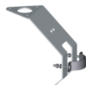
Holder compact 506347

The holder serves for the mounting of a wind transmitter, Compact-type, onto an instrument carrier or mast.